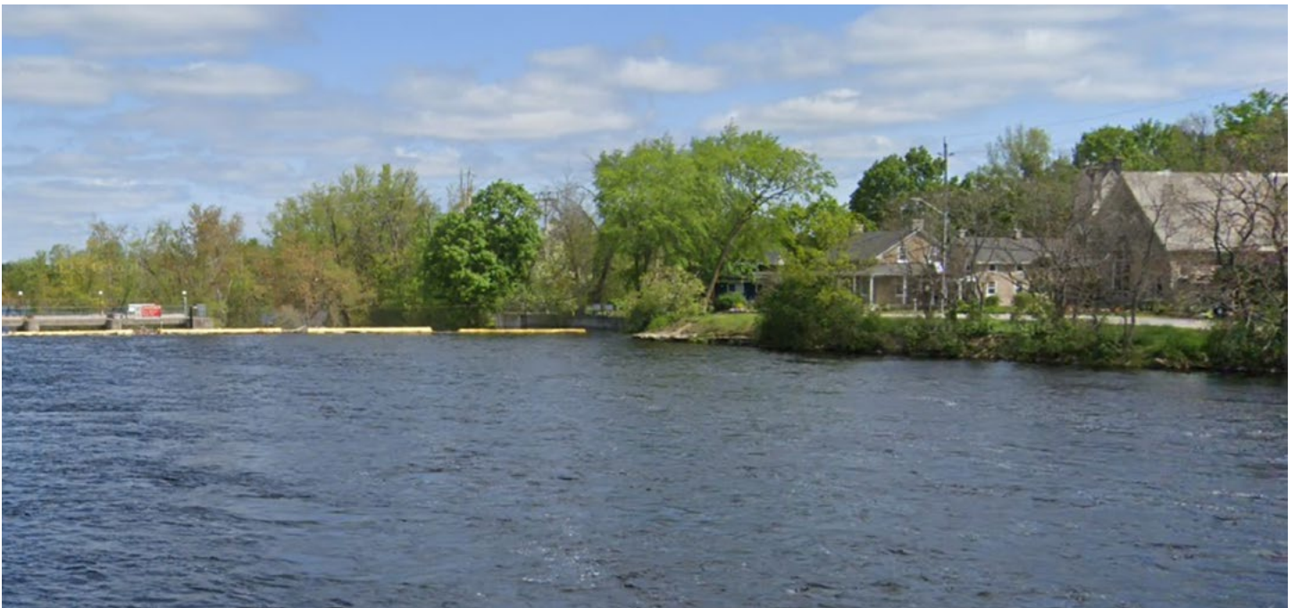
Fig. 11 View from Country Road 11, Former United Church and Teskey House on the right, Credit: Google Street View 2023