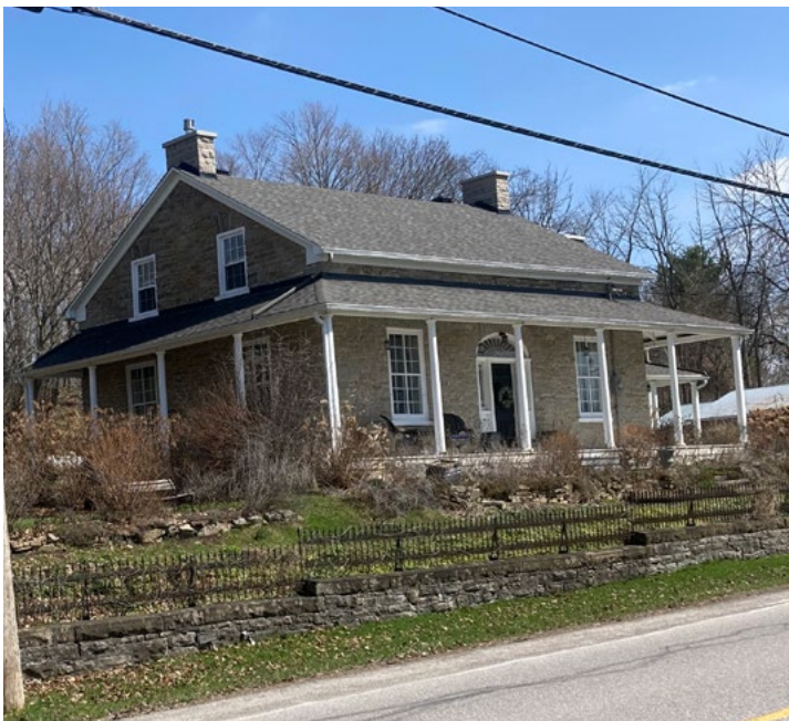
Fig. 6 Teskey House, Main House