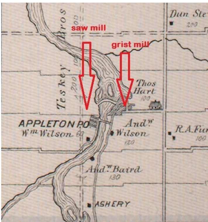
Fig. 10 The first mills in Appleton.