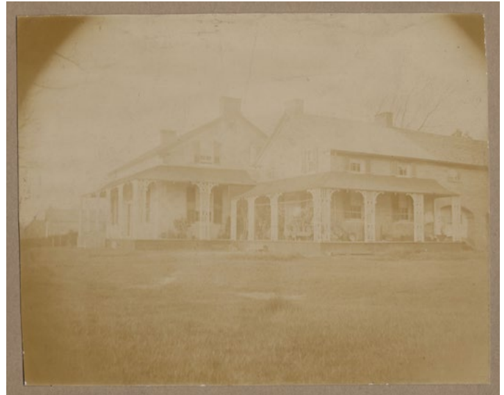
Fig. 3 The Teskey House in the 19th century. Treillage, the delicate wood trim on the verandah, was popular at the time, Credit: Teskey papers, North Lanark Museum