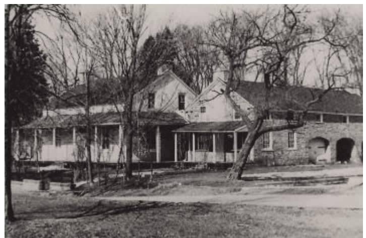
Fig. 4 The Teskey House in the mid 20th century, Credit: Teskey papers, North Lanark Museum