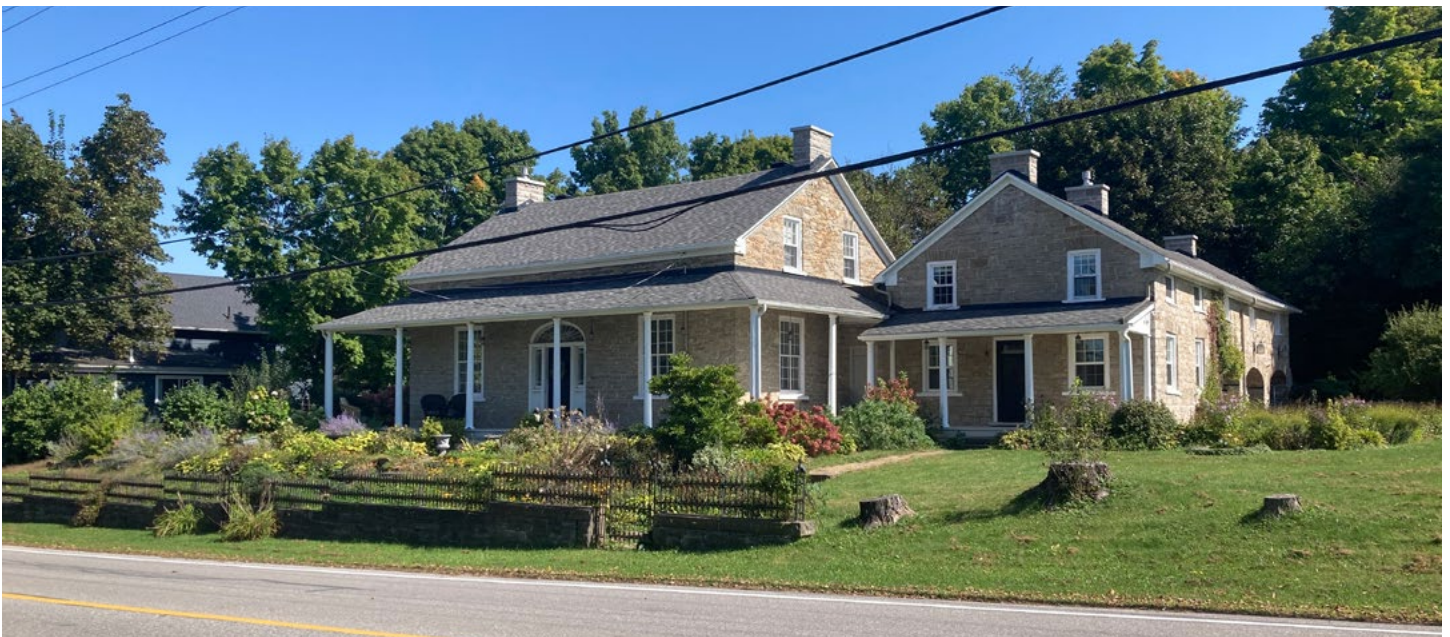
Fig. 5 Teskey House River Road façade