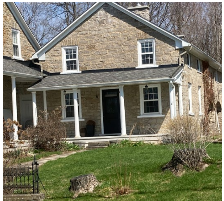
Fig. 7 Teskey House, Addition River Road façade