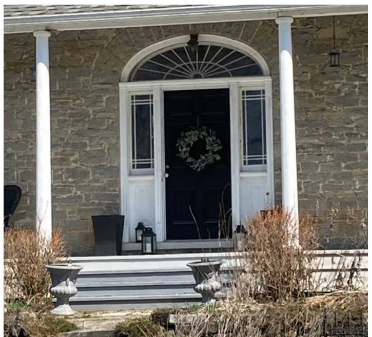
Fig. 9 Teskey House, Main House's Front Door