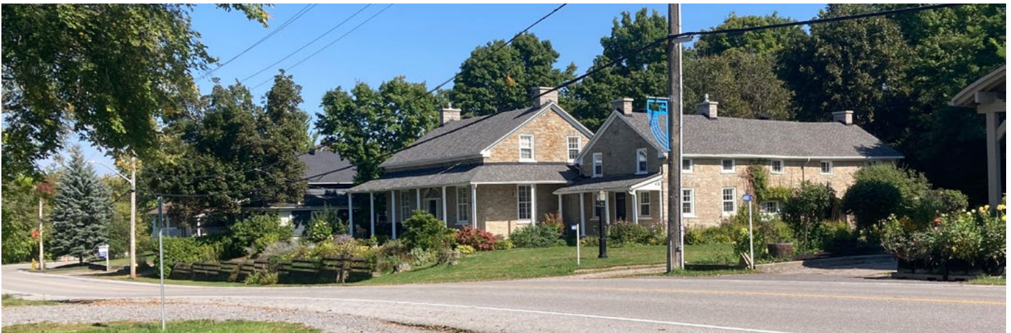
Fig. 1 Teskey House, View from River Road

As an excellent example of a Georgian House, built by Joseph Teskey, an Irish Palatine, whose family had emigrated to Upper Canada from Ireland as part of the Peter Robinson migration, the property has cultural heritage value for its design, historical and contextual values. It meets seven of the nine criteria for designation under Part IV of the Ontario Heritage Act .