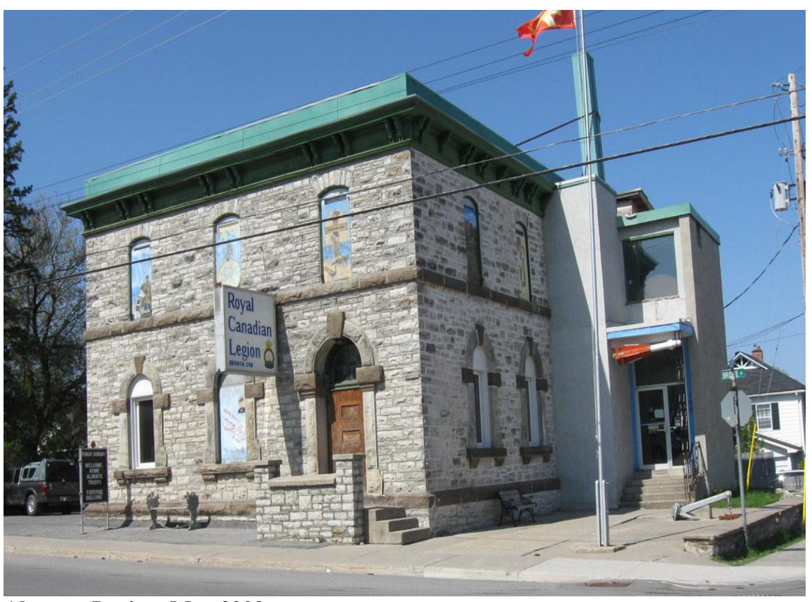
Almonte Legion, May 2009