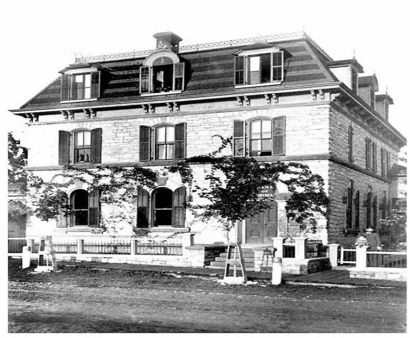
Compliments: Archives of Bank of Montreal