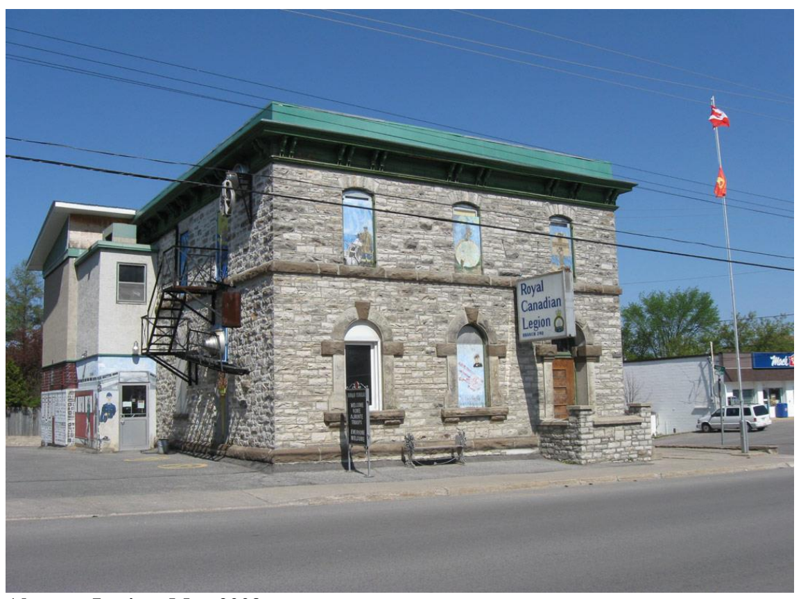
Almonte Legion, May 2009