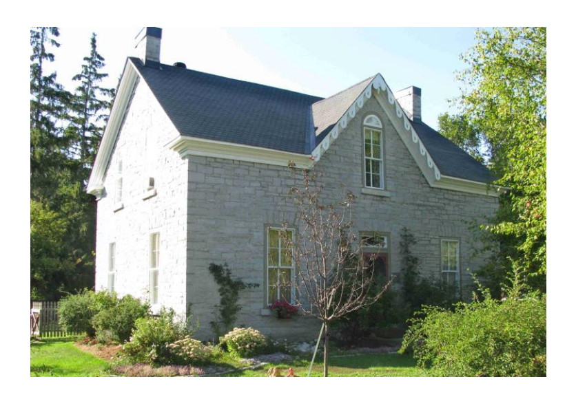
Photo 3 – below: This shows the house as it was in 2008. The lines and symmetry of the Ontario cottage style are more apparent without the porch. The transom detail is also more visible.