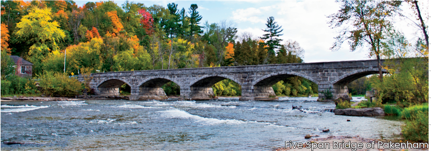
Five Span Bridge of Pakenham