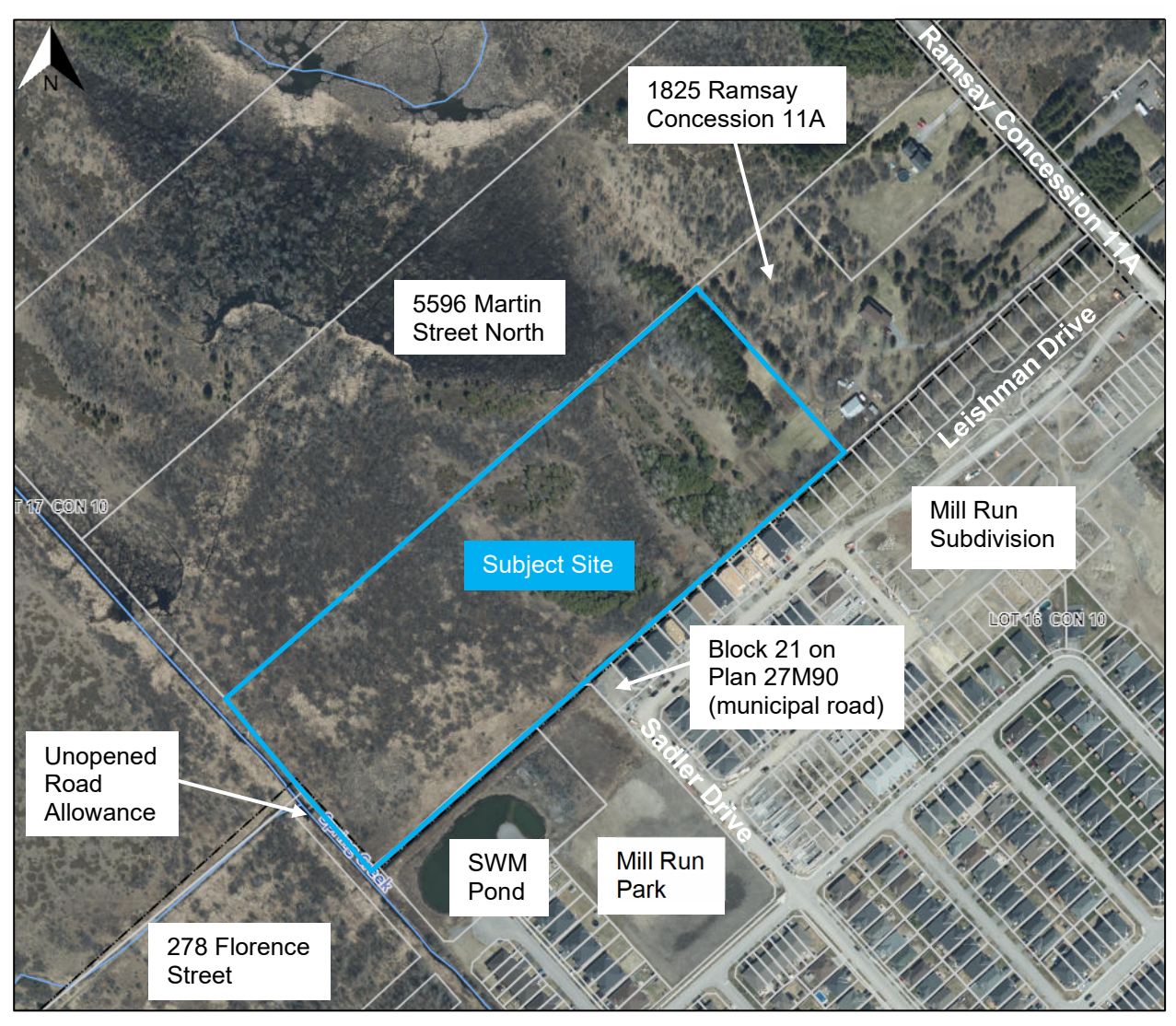
Figure 3: Subject Site and Surrounding Area