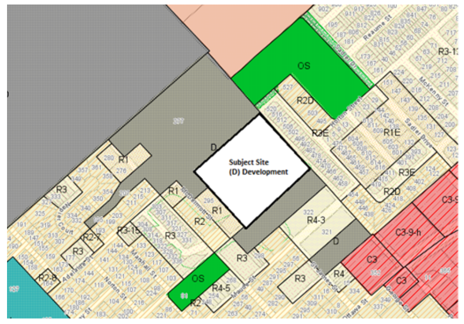
Figure 3: Zoning of subject property