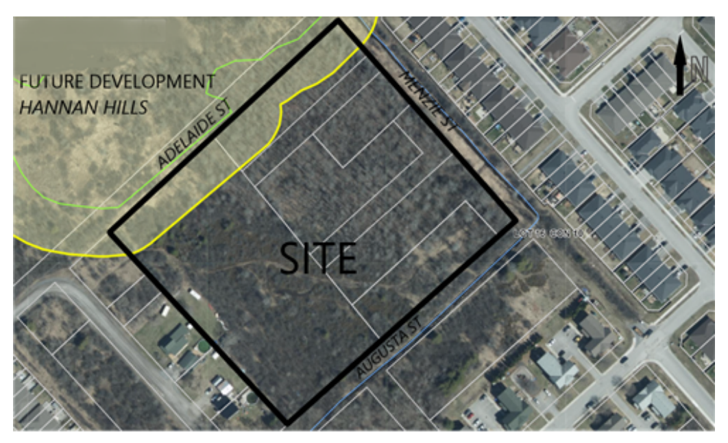
Figure 1: Location of Subject Property

property is zoned as Development (D) in the Municipality of Mississippi Mills Zoning By-law 11-83, and it is understood that a Zoning By-law Amendment will be required as a condition of Draft Plan approval.